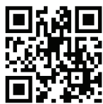
LNE Home Page